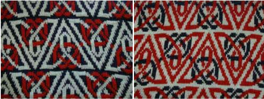
Two sides of three coloured fairisle