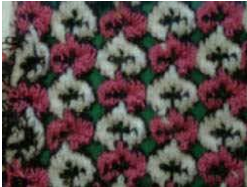
4 colour fairisle with one colour in lycra