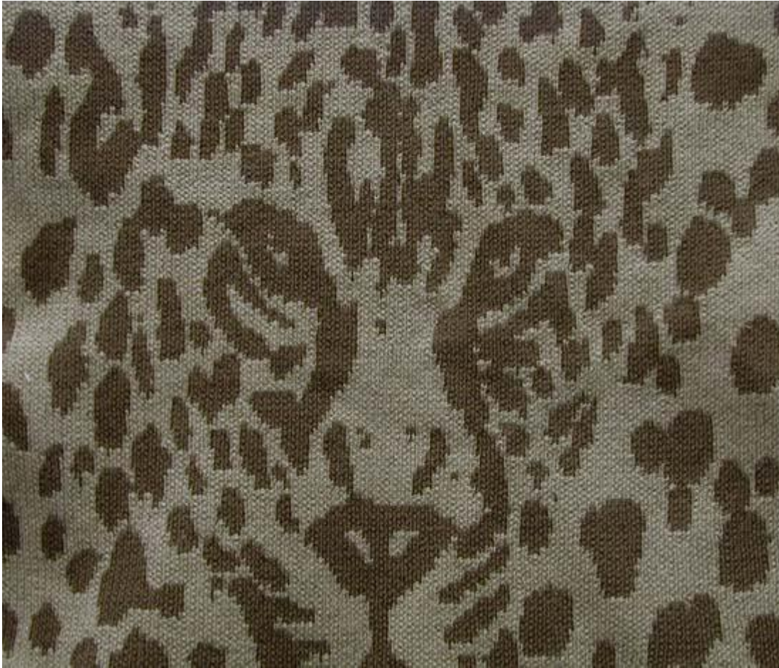
Large single motifs