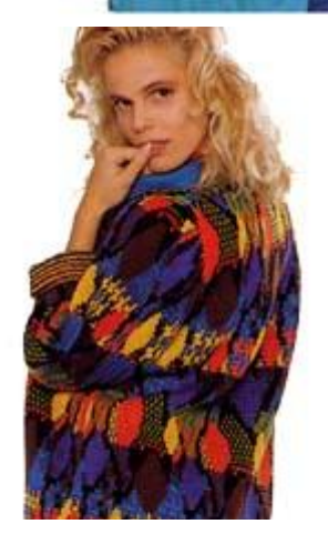
TAKE YOUR CHOICE FROM

Thanks to the latest electronics the PASSAP ELECTRONIC 6000 is not only more versatile but it makes knitting easier than ever before. In future you decide what you want to knit. Your PASSAP ELECTRONIC 6000 asks you a series of simple questions and then the ingenious Dialog-Computer tells you step by step, in easy to follow instructions, what to do. The result is perfect knitting all the time and your hobby will be more enjoyable than ever.